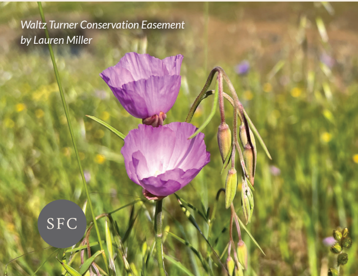
Waltz Turner Conservation Easement by Lauren Miller

Planned giving is one of the ways that SFC ensures the organization's durability and growth into the future. It is also a practical way to donate and support local land conservation efforts with considerable tax benefits to you, the donor.