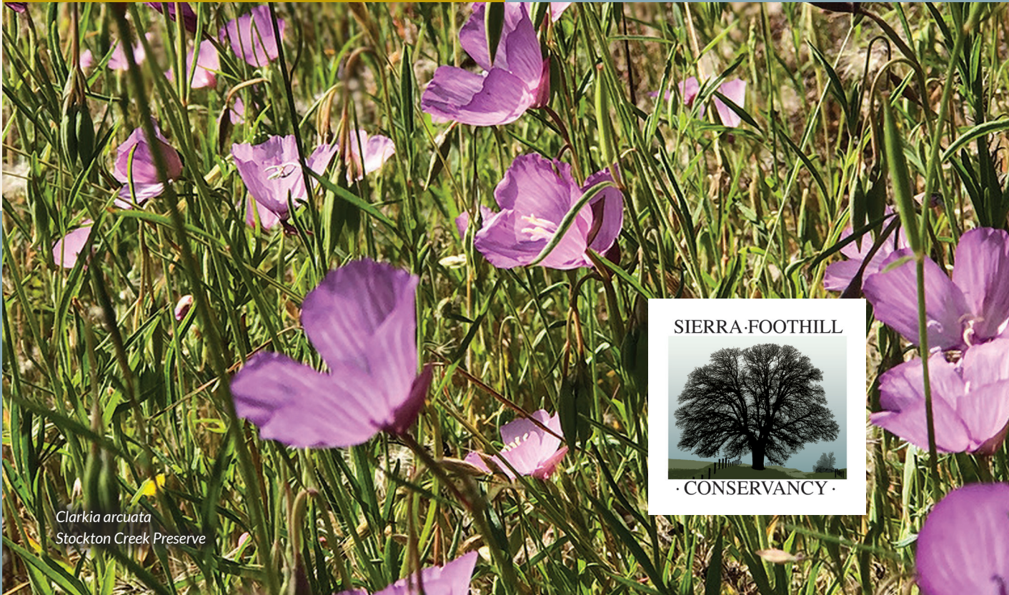
Clarkia arcuata Stockton Creek Preserve

SIERRA Foothill CONSERVANCY AT (209) 742-5556 OR SFC@SIERRAFOOTHILL.ORG